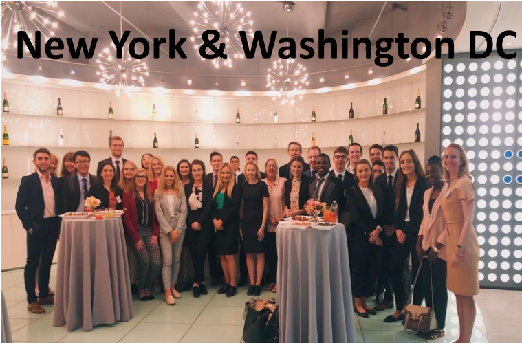
New York & Washington DC